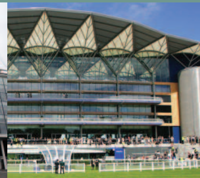
Ascot Racecourse Main plant and system attenuators