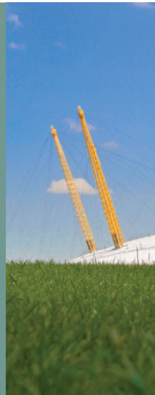
Millennium Dome Circular exhaust attenuators within main masts