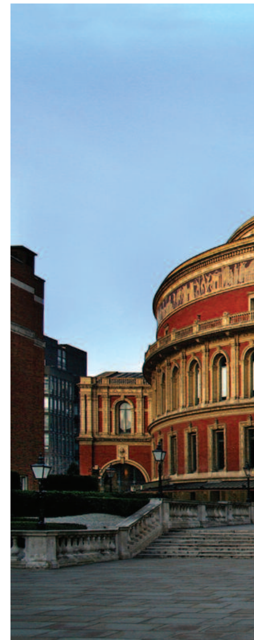
Royal Albert Hall Attenuators for very low noise criteria areas

The scope of product systems covered by this service includes: acoustic enclosures; acoustic panel and acoustic louvre screens; large attenuator assemblies and acoustic lining. Detailed CAD drawings or 3D models are provided for client approval as part of this service.