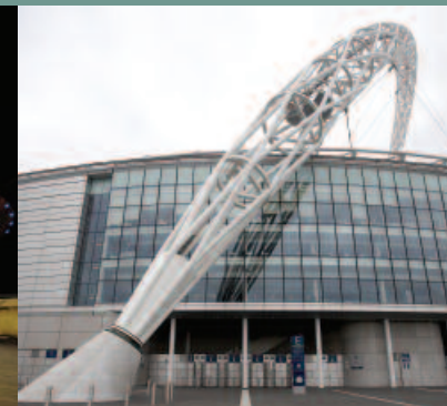
Wembley Stadium Standard and fire rated attenuators for the entire project